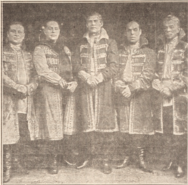
IMPERIAL RUSSIAN SINGERS WHO WERE GUEST ARTISTS AT THE COMMUNITY CONCERT LAST EVENING