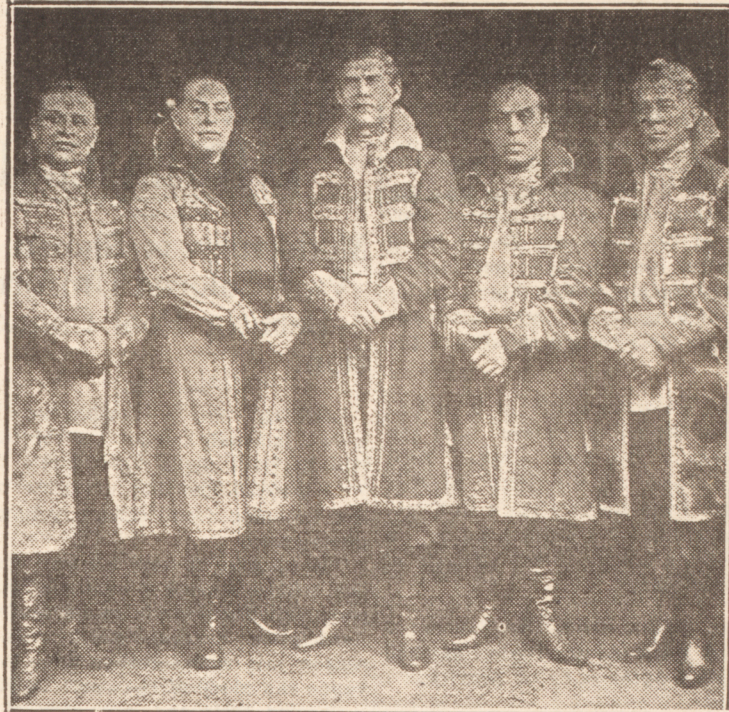
IMPERIAL RUSSIAN SINGERS WHO WILL BE GUEST ARTISTS AT THE COMMUNITY CONCERT THIS EVENING.