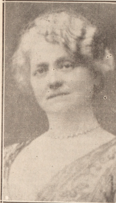
RT. HON. LADY ASHBURNHAM Hostess This Evening