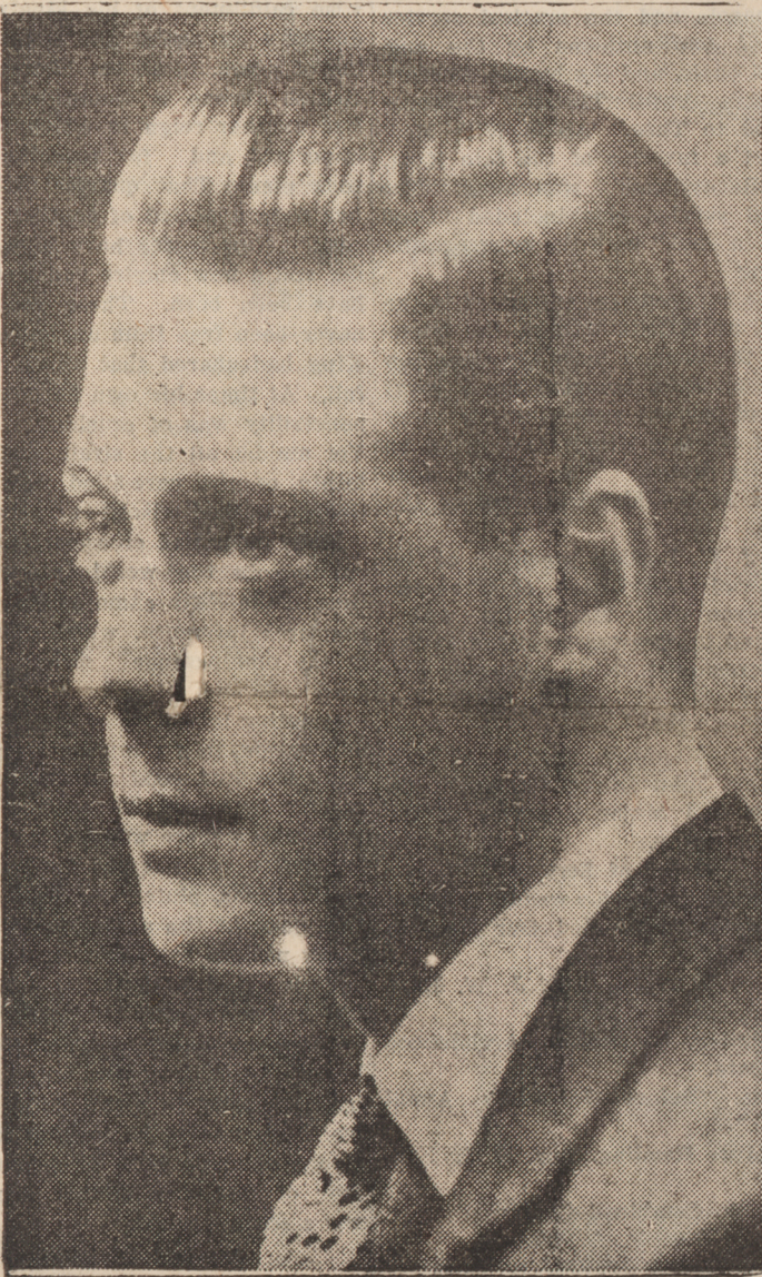
His Majesty Edward VIII

An Empire Renews Its Loyal Devotion to the Sovereign Throne