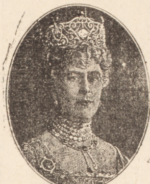
QUEEN MARY Who is Celebrating Her 69th Birthday Today