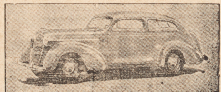
PLYMOUTH DE LUXE TWO-DOOR TOURING SEDAN