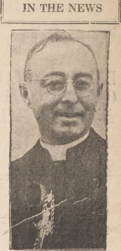
CARDINAL VILLENEUVE Urges steps to guard young Canadians against invasion of communism.