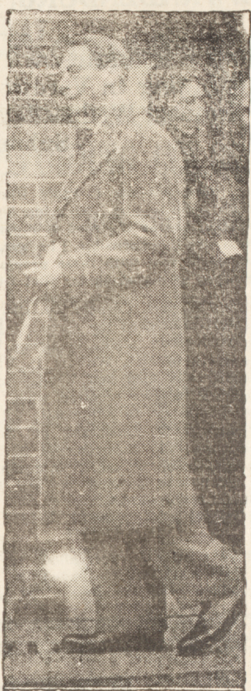
KING GEORGE VI., unperturbed by cries of an insane man at Cenotaph yesterday.

The military figures and police officers rode over to make sure the