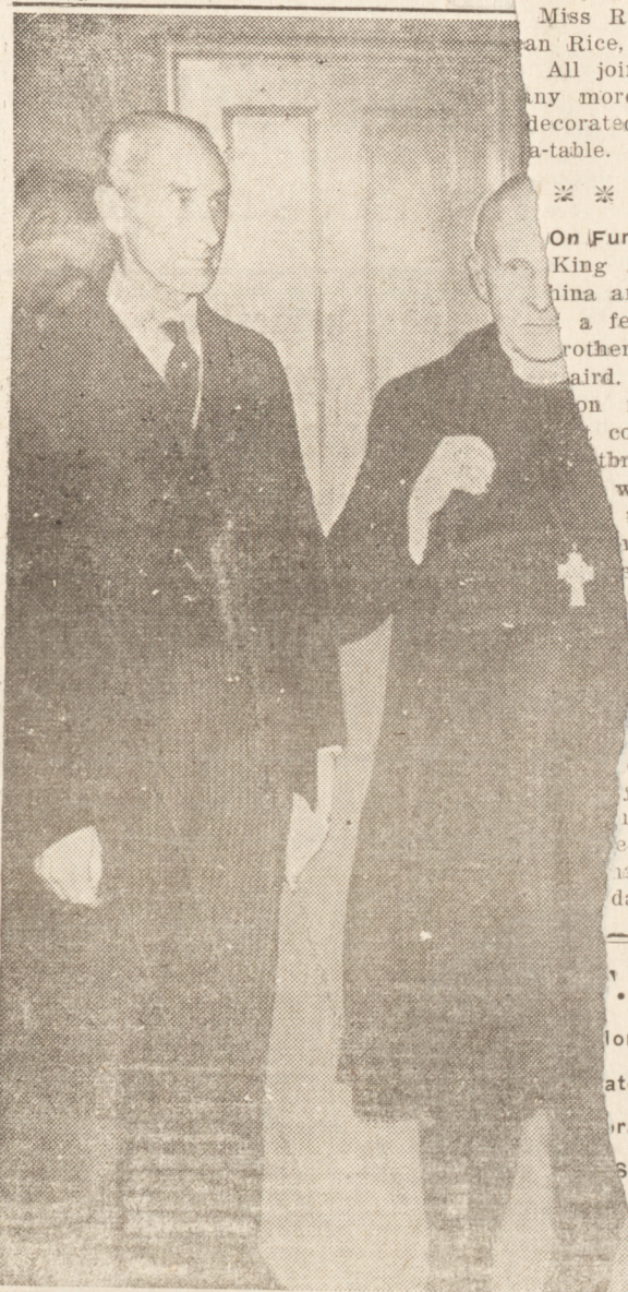
This group of notables, headed by the Archbishop of Canterbury, arrived in Fredericton for the "massacre of civilians in China." Left to right: The Earl of Halifax; Lady Violet Bonham-Carter; Herbert Morrison, Labor lea