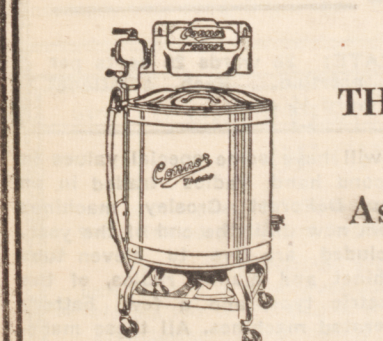
THE CONNOR WASHER