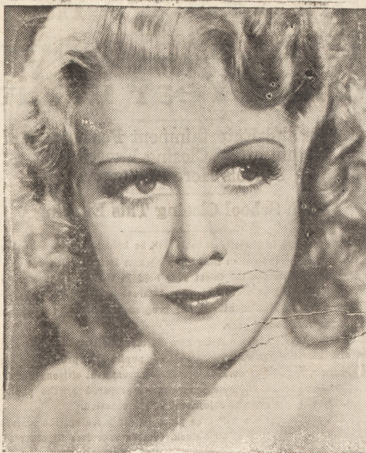
Gladys George will embellish the Chase and Sanborn Hour on NBC July 11. She'll appear in a dramatic sketch with Don Ameche, the program's master of ceremonies.

HOLLYWOOD, June 29 — Gladys George, the glamorous actress who stood Broadway on its ears two seasons ago with her imitation of glamorous actress in "Personal Appearance," makes a personal appearance on the Chase and Sanborn Hour on Sunday, July 11.