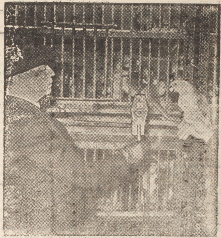
More than 400 monkeys were the honored, but uninvited, guests at an audition given to 150 parrots by National Broadcasting Company talent scouts seeking candidates for the NBC broadcast which will determine America's best talking parrot. Here's a scene as a parrot in an animal storage plant in New York went through his paces to the delight of the monkeys.