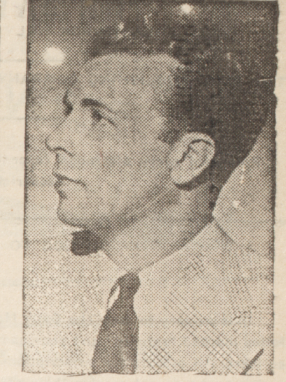
Dick Powell will be master of ceremonies of Your Hollywood Parade broadcasts on NBC.