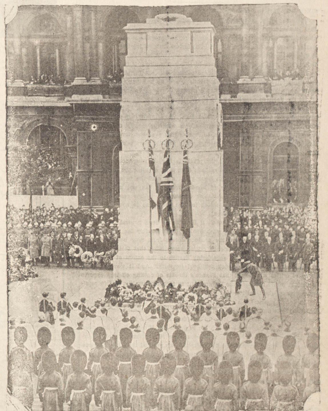
The Cenotaph in London as an Empire mourns its heroic dead on Armistice Day. The late King is seen placing his wreath. This scene—but with another King—was re-enacted Thursday.