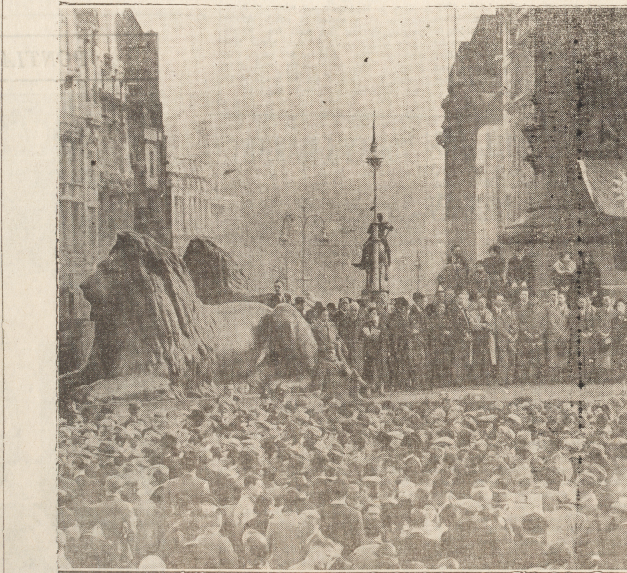
Men and women flocked to Trafalgar Square to join in a Japanese aggression demonstration. Many Chinese men and women joined in, and a few added their voices to those of the speakers, of which this is a general view. Big Ben and Whitehall are seen in the background.