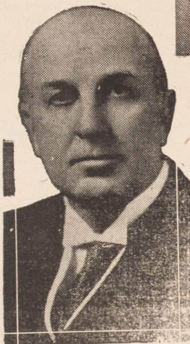
HON. R. B. HANSON, K.C., P.C., LL.D., who was taken suddenly ill in Florida. His condition is improving

Word was received here on Friday last that Hon. Dr. R. B. Hanson, K.C., P.C., former Minister of Trade and Commerce, had been taken suddenly