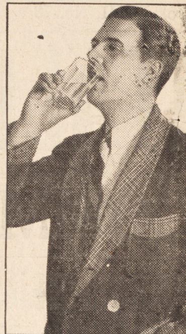
2. If throat is sore, crush and stir 3 "ASPIRIN" tablets in 1/2 glass of water. Gargle twice.