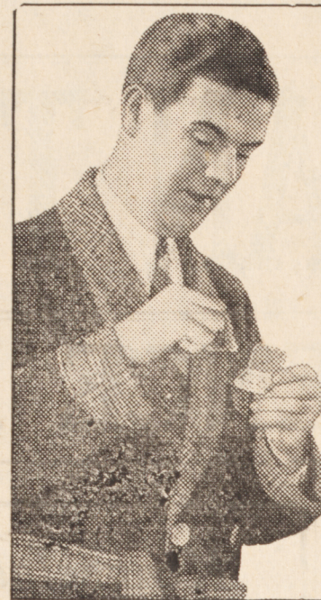
1. Take 2 "ASPIRIN" tablets and drink a full glass of water. Repeat treatment in 2 hours.