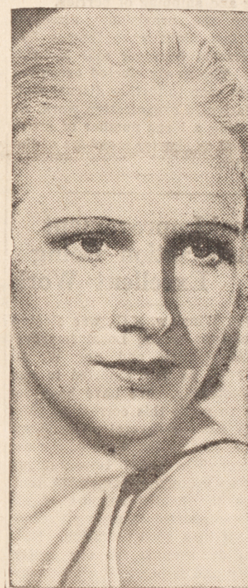
Ann Harding . . . She'll bring drama to her husband's program.

Kitty Carlisle is from New Orleans. As distinguished from some of the young singers who have appeared on the Promenade Concerts programmes lately and whose musical training was, in so many cases, entirely American, Miss Carlisle was brought up entirely in European musical circles. This happened because her mother lived almost entirely in Europe after her father, a prominent physician in the Louisiana city, had passed on. Her steps in professional life, although her training had been for the