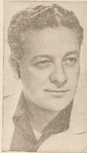
And four days later Andy (above) will take an altar march in Glendale, Calif.

HOLLYWOOD, Sept. 1—For the first time in ten years as top-ranking radio favorites, Amos 'n' Andy, famous blackface team, will appear as guest stars on a major variety broadcast. The popular funsters will join tenor Lanny Ross and comedian Charles Butterworth in launching their new Packard Hour with soprano Florence George and Raymond Paige, musical director, over the NBC-Red Network, Tuesday, September 7, at 9:30 p. m., EDT.