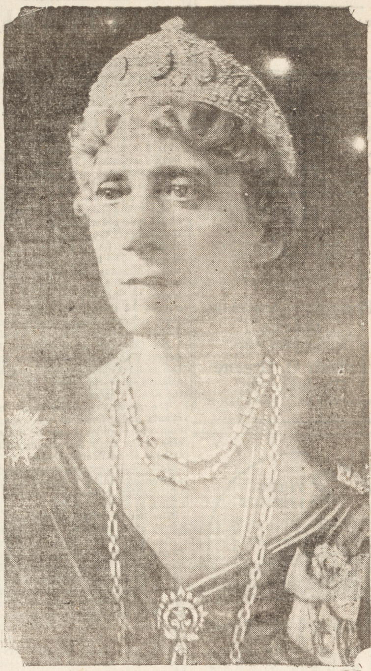
TWO new and interesting portraits of H. H. Princess Helena Victoria, left, and her sister, H. H. Princess Marie Louise, grand-daughters of Queen Victoria, and daughters of Princess Helena Victoria and Prince Christian. The royal sisters are cousins of King George VI. Both are constantly engaged in philanthropic work and their permanent residence is Schomberg House, Pall Mall, London, England.

Attaches Semi-Religious Significance to His Military Service; Considered Most Proficient Man With A Bayonet