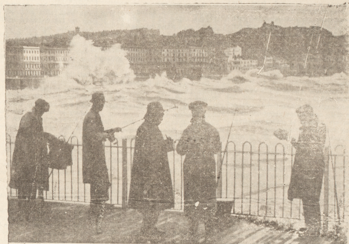
At Hastings, in Sussex, Eng., pounding seas and heavy rain featured the opening of the annual Hastings angling festival. Amongst the competitors are several from France and Germany. Anglers are seen competing with high seas as well as the fish during the festival.