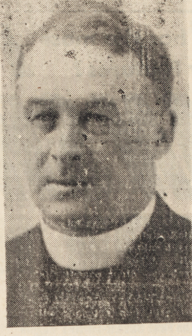
ELKS MEMORIAL SERVICE