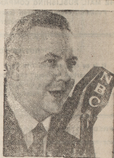
Lauritz Melchior is Lohengrin in the opera of the same name to be broadcast over NBC from the Metropolitan Opera on Saturday, February 19.