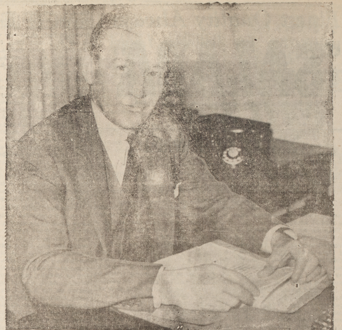
McGill University has welcomed its new principal Dr. Lewis Williams Douglas, who is shown in the above photo, specially posed, at his desk in the University offices.