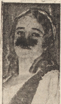
Elisabeth Rethberg as Desdemona.

Giovanni Martinelli, Lawrence Tibbett and Elisabeth Rethberg will be heard in principal roles in the Verdi opera "Otello" to be broadcast in full for the first time in the United States direct from the stage of the Metropolitan Opera on Saturday, Feb. 12, beginning at 2:55 p.m., AST, over the NBC-Blue Network. The opera sung this season at the Met for the first time since 1913, will be the fifth revival to be heard in the current NBC opera series.