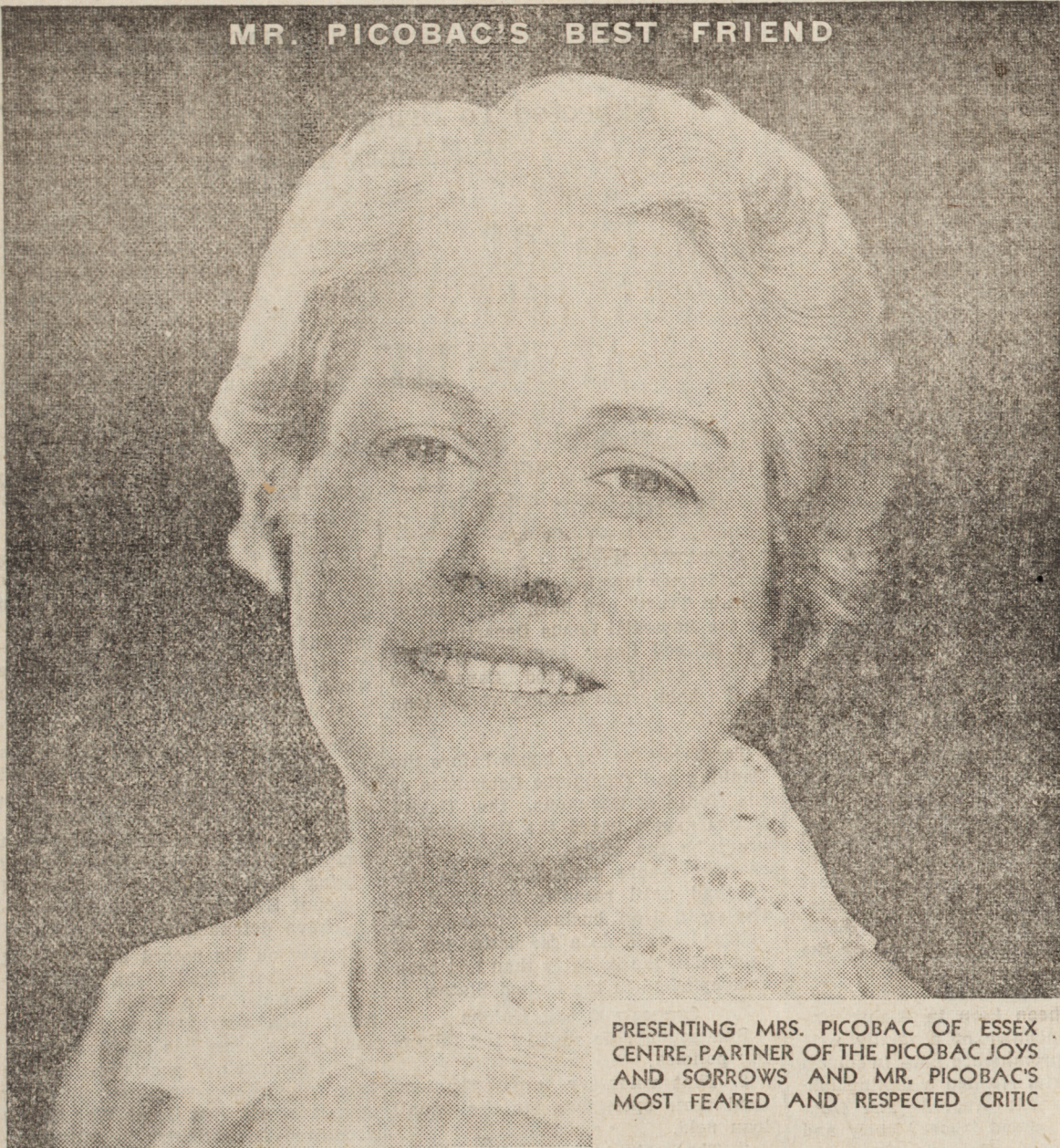
MR. PICOBAC'S BEST FRIEND