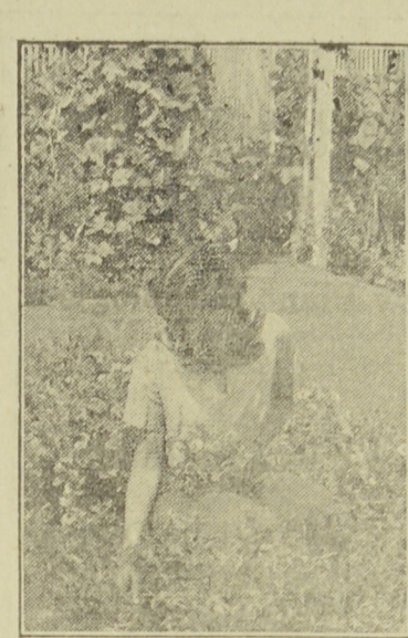
ANNUAL border will decorate garden and furnish flowers for cutting.

Annual flowers which grows to maturity, produce blossoms, seed and die in one season, have rapidly improved in recent years.