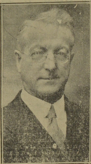
MAYOR W. G. CLARK

Who Is The Liberal Candidate in York-Sunbury Counties In Today's Fight For Good Government.