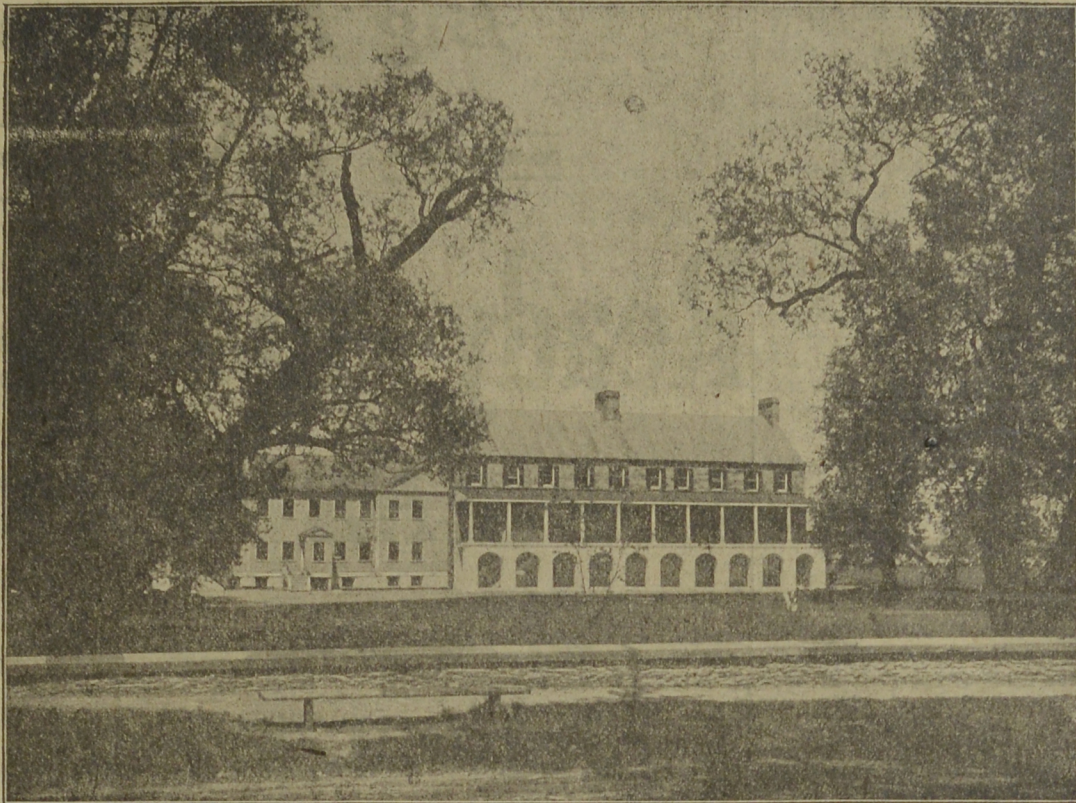
ONE OF FREDERICTON'S BEAUTY SPOTS.

London, July 19—"There was something in the air on the other side of dull," said the Duchess of Connaught the other day. Since she has become convalescent. Her Royal Highness is doing things she never did before she went to Canada. She now does much of her own shopping, in the company usually of some intimate friend. Shopping the duchess avers, is a fine cure for the "blues" from which she has suffered more or less since she has been back in England. In a great temple of frocks in Dover Street the other morning, the duchess walked leisurely about through avenues of beautiful gowns and opera cloaks. People were beginning to fly out of town when suddenly came the announcement in the court circular that the king and queen intended to give another court ball this month. This was done with the sole object of keeping the world and his wife in London until the close of the season. His burning desire to do his duty is making an old man of the king. He is looking ten years older than he really is.