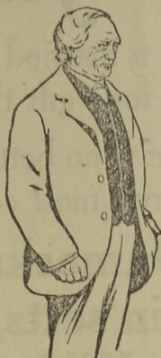
Vigorous health at 70 due to Dr. Morse's Indian Root Pills.

Dr. Morse's Indian Root Pills Purify the Blood and Prolong Life