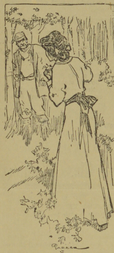
Came Out Almost Facing Pete Corson.

When the Sinton had taken Mrs. Comstock home they stopped to see if Elnora was safe. She was not at home, and they had not seen her along the way. Mrs. Comstock called about the edge of her woods and received no reply. Then Sinton turned and drove back to the Limberlost. He left Margaret and Mrs. Comstock holding the team and entertaining Billy and entered the swamp.