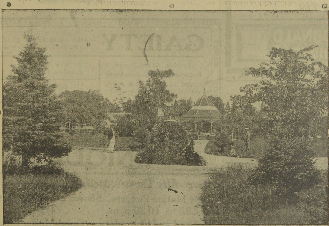
VIEW IN WILNOT PARK.