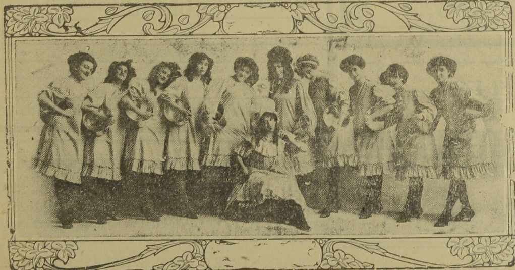
MARCUS MODERN MINSTERL MAIDS AT THE OPERA HOUSE ALL THIS WEEK