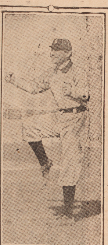
HUGH JENNINGS, MANAGER OF THE DETROIT TIGERS, DANCES ON ONE FOOT, SHOUTS "HEY HAW!" WHISTLES AND EARLY DUBBLES OVER WITH GINGER.

"Hughy" Jennings, leader of the Detroit Tigers, is still confident that his team will finish first at the end of the season, in the race for the American League pennant. "Hughy" is an excellent manager, full of points to his players. Jennings is a great favorite with the fans, and his famous "Ee-yah" cry is always welcome tune to his many friends in the baseball world.