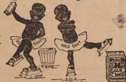
"Let the GOLD DUST Do your work"

Your servant can do more and better work and keep sweet with the aid of GOLD DUST in all household cleaning.