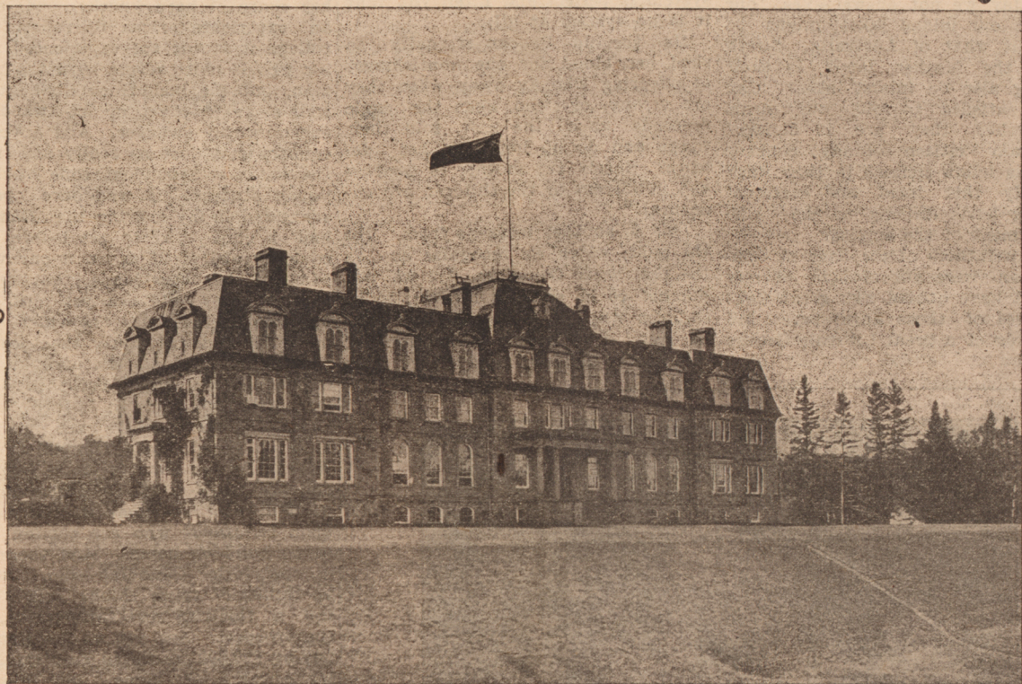
THE UNIVERSITY BUILDING.

Provincial University Celebrates Jubilee—Class of Thirty-five Graduated Today—First Degrees in Forestry Given— Large Number of Graduates Attend Encoenia.