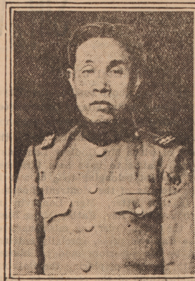
LIEUT. M. SHIRASE

The Japanese Antarctic expedition under Lieutenant Shirase started on November 28 from Shinagawa Bay, Japan, aboard the 150 ton schooner Kainan Maru. In the opinion of foreign experts the preparations are wholly inadequate, and the expedition is doomed to failure, possibly disaster. Lieutenant Shirase, who is about