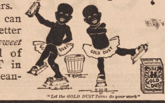
Made by THE N. K. FAIRBANK COMPANY Makers of FAIRY SOAP, the oval cake.

time and tempers. Your servant can do more and better work and keep sweet with the aid of GOLD DUST in all household cleaning.