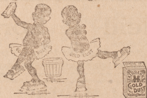
"Let the GOLD DUST do your work"

Your servant can do more and better work and keep sweet with the aid of GOLD DUST in all household cleaning.