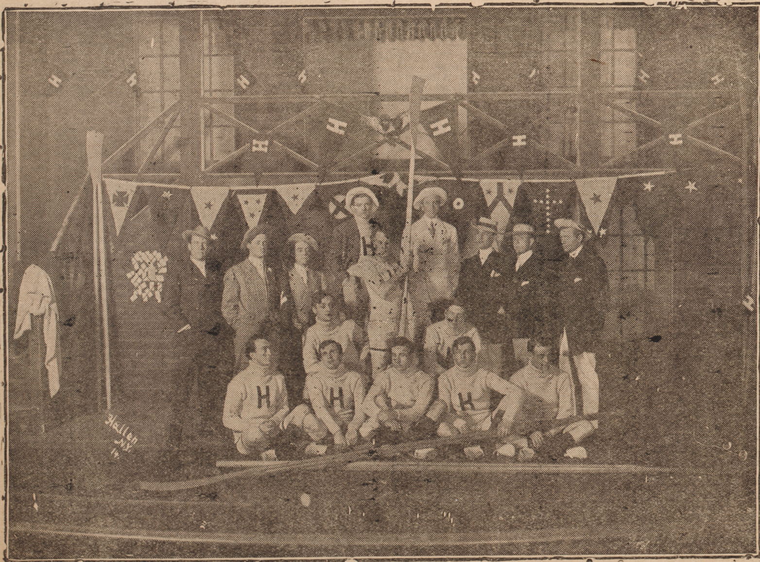
FAMOUS THIRD ACT BOAT HOUSE SCENE IN KIRK BROWN'S PRODUCTION OF "BROWN OF HARVARD" AT THE CITY OPERA HOUSE, THURSDAY EVENING, JUNE 9th

Heitmuller is said to be the heaviest man in the American league. He weighs away over 200 pounds.