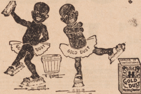
"Let the GOLD DUST do your work"

Your servant can do more and better work and keep sweet with the aid of GOLD DUST in all household cleaning.