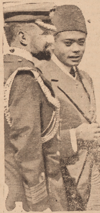
SULTAN SEYRID ALI AND BRITISH NAVAL OFFICER.

And now the sultan of Zanzibar is making a trip through Europe, though he is not lecturing any to speak of. His dusky highness went to London to be present at the funeral of the