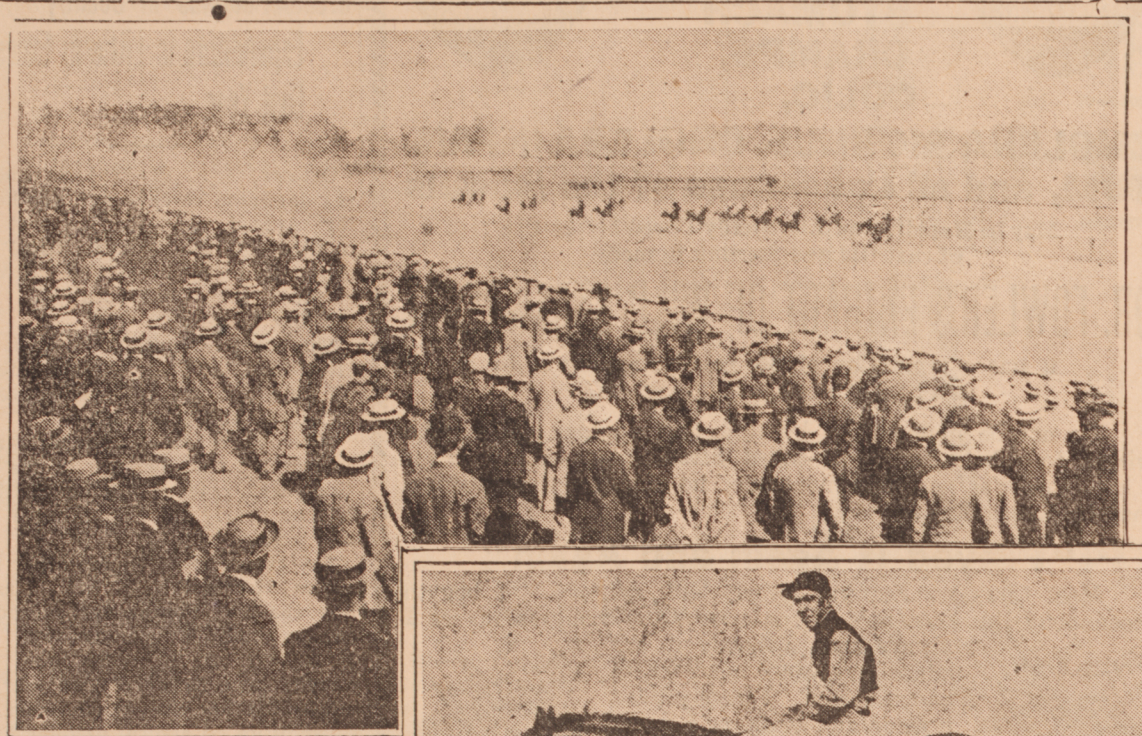
WATCHING A FINISH AT SARATOGA