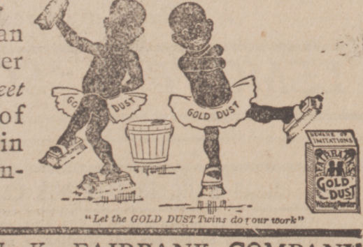
Made by THE N. K. FAIRBANK COMPANY Makers of FAIRY SOAP. the oval cake.

Your servant can do more and better work and keep sweet with the aid of GOLD DUST in all household cleaning.