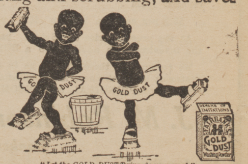
"Let the GOLD DUST Twins do your work"

Your servant can do more and better work and keep sweet with the aid of GOLD DUST in all household cleaning.