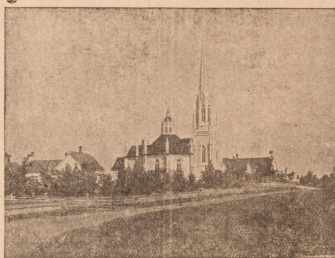
METHODIST CHURCH, MARYSVILLE. Building destroyed yesterday. House on right of church also destroyed