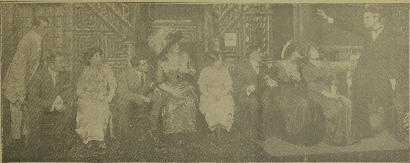
A SCENE FROM "OVER NIGHT" OPERA HOUSE, THURSDAY EVENING, SEPTEMBER 25