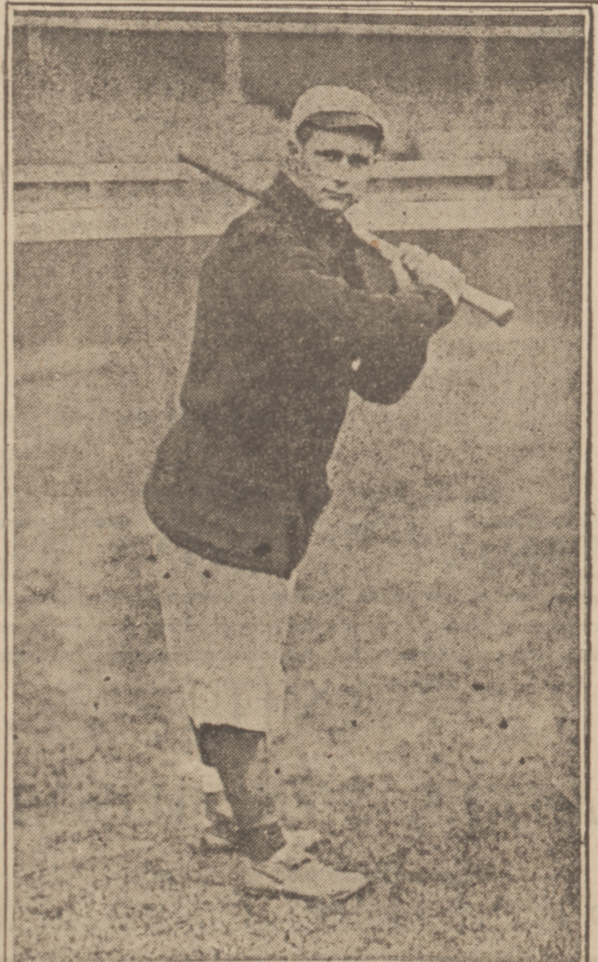
DEVORE. In Cham. Ship Series.