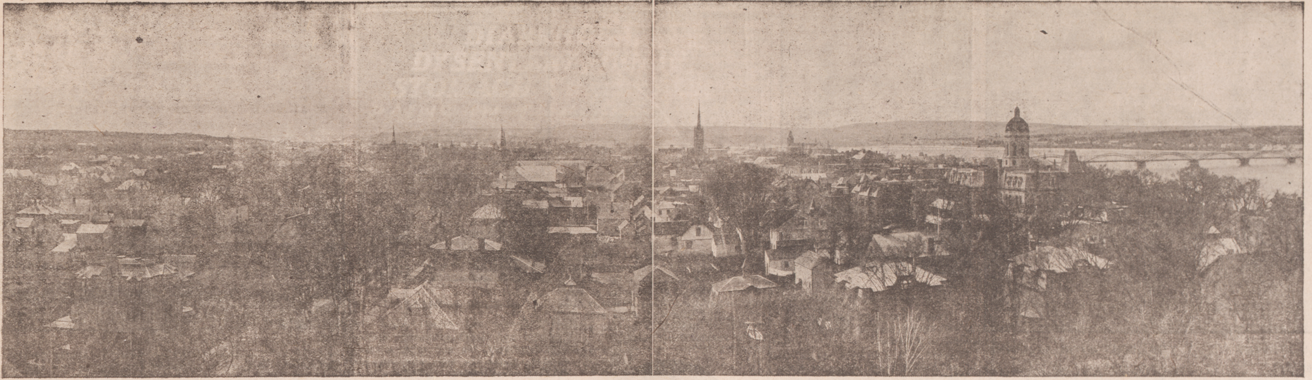
PANORAMIC VIEW OF FREDERICTON.