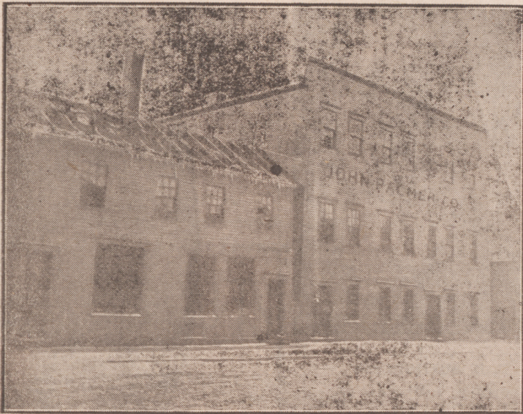
THE PALMER CO'S FACTORY

One of the best industries in Fredericton is the John Palmer Company, Limited, manufacturers of Oil-Tanned Footwear. This enterprising concern employs 100 hands with a weekly pay roll of $1000 and has an annual output in excess of a quarter of a million dollars. Its goods are sold in every province in Canada from Halifax to Vancouver and also in Alaska and the Yukon territory. There is also a great demand for this company's goods in the United States and during the past few years a large and profitable mail order trade has been worked up in that country in