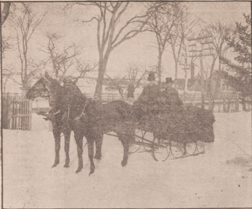
A SAMPLE TURNOUT,