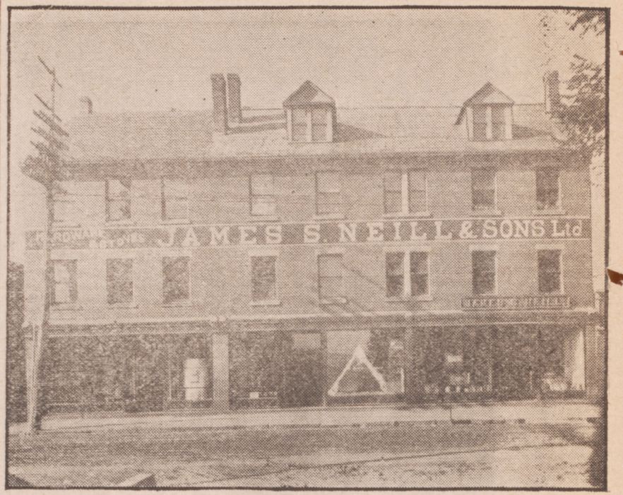
JAS. S. NEILL &amp; SONS, LTD

proprietor of the Dairy Depot who has made his mark in the milk business. A short time ago he commenced to pasturize his milk. Do you know what pasturized milk is? It is milk cleansed with all the germs taken out. His plant is complete for cleaning and pasturizing his milk. He never disappoints a customer if possible in the delivery of his milk on time, also he requests all in Fredericton as well as those coming to the Exhibition to look over his business place.