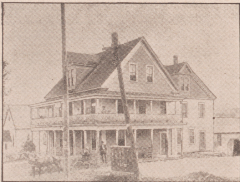
RIVER VIEW HOTEL, STANLEY

is up-to-date, that show goods to perfection, increases your business and makes money for you. Call and see him.