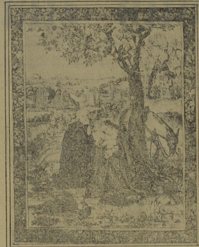
PANEL OF TAPESTRY, FLEMISH 15TH CENTURY SOLD FOR $40,950.

PAYS $40,950 FOR TAPESTRY PANEL OF 15TH CENTURY AT LONDON SALE